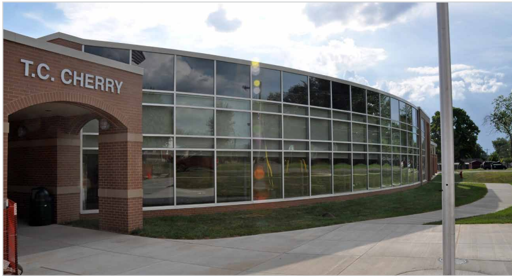
TC Cherry Elementary School - Bowling Green, Kentucky