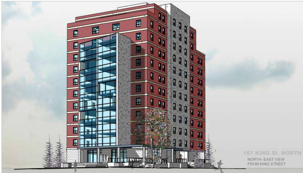
Student Residence - 167 King Street, Waterloo, ON