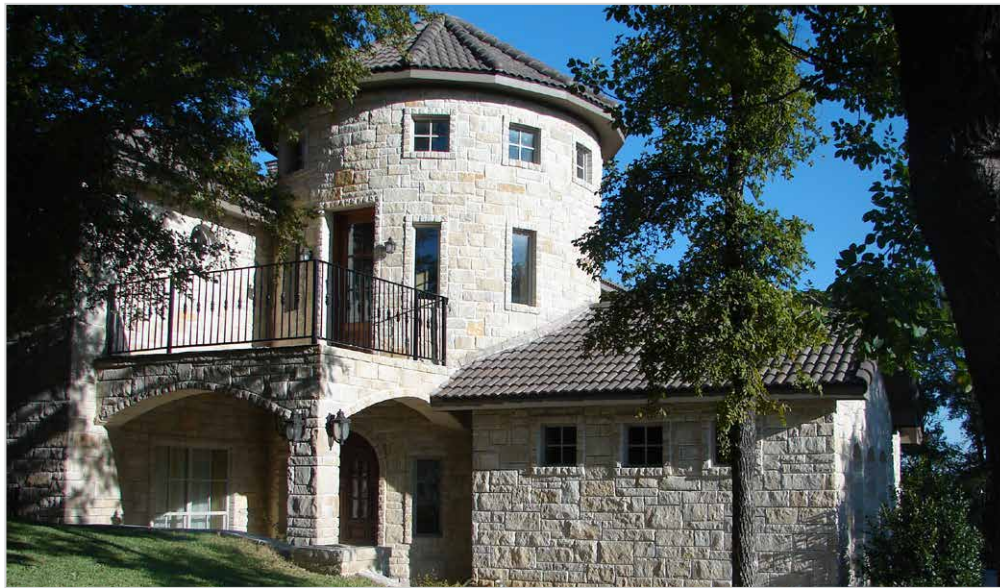
Fort Worth Residence - Fort Worth, Texas