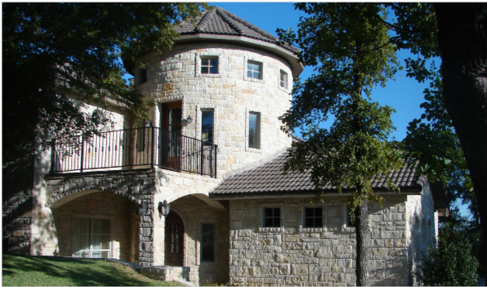
Fort Worth Residence - Fort Worth, Texas