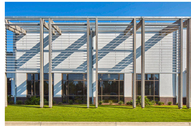
Dune Lakes Elementary School Santa Rosa Beach, Florida