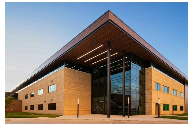
Panther Creek High School Frisco, Texas