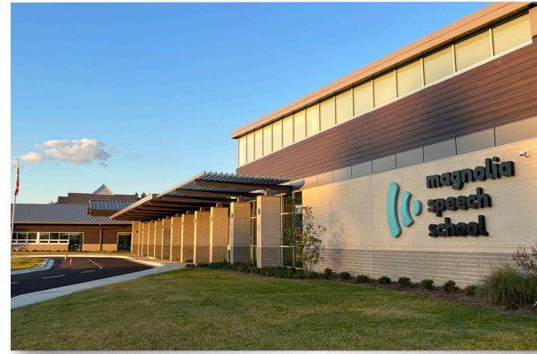
Magnolia Speech School Madison, Mississippi

The density and insulation of ICF walls dampen outside noises for a quieter, more productive learning environment. They can also be used for interior walls for sound attenuation of gymnasiums and theaters.