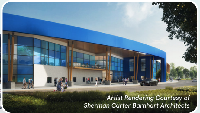
Artist Rendering Courtesy of Sherman Carter Barnhart Architects