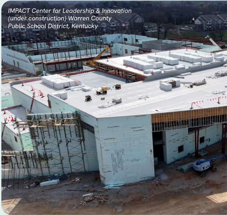
IMPACT Center for Leadership & Innovation (under construction) Warren County Public School District, Kentucky